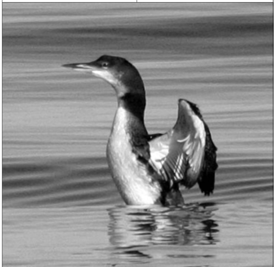
Common Loons ( Gavia immer ) can be found on Christmas Bird Counts in good numbers coastally across North America, and a new high count for Canada (618) was set this season at Comox, British Columbia.

(Wallaceburg, ON); Baltimore Oriole, 6 (Halifax-Dartmouth, ON); Gray-crowned Rosy-Finch, 2 (Vancouver, BC); Pine Grosbeak , 836 (Kenora, ON); Purple Finch, 425 (Louisbourg, NS); Cassin's Finch, 8 (Kelowna, BC); House Finch, 1805 (Kelowna, BC); Red Crossbill, 586 (Sooke, BC); White-winged Crossbill , 1293 (Algonquin Prov. Park, ON); Common Redpoll, 2286 (Ferryland, NL); Hoary Redpoll, 59 (Fort Simpson, NT); Pine Siskin, 2720 (Ferryland, NL); American Goldfinch, 1679 (Wolfville, NS); Evening Grosbeak , 846 (Gander, NL); House Sparrow , 5906 (Winnipeg, MB).