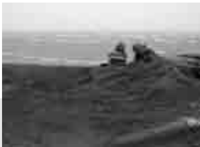
Getting thoroughly sandblasted while “hurricane birding” during the Tlell CBC.

“Service temporarily suspended until further notice due to an extended storm warning, which includes hurricane-force southeast winds over the next twenty-four to thirty-six hours,” reported the BC Ferries sailing update.