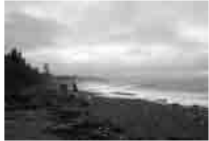
Storm clouds over the beach at Tlell.

field, they feeder-watch, check their favorite local spots, and call us with their sightings prior to and after the counts. Although people in every community know that the counts are occurring, apart from a coterie of very committed people, some may not want their names mentioned or recorded, and we often hear, sometimes thrice removed, of a bird seen somewhere. It can be a guessing game to see who will or will not participate, but there have been an amazing number of people over the years who have made the count part of their Christmas season.