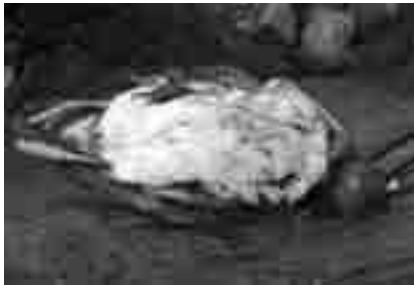
Lifeless Cassin's Auklet washed up on Tlell beach, February 2006.

local supermarket, the wild world doesn't have the same luxury. The seas that kept the Queen of Prince Rupert tied to the dock wreaked havoc on offshore birds. The unremitting hurricane-force winds that swept up Hecate Strait from