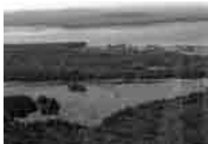
The Delkatla Wildlife Sanctuary is checked more than once a day; aerial view of the sanctuary.

Black Brant at Sandspit, a marina would probably have been built on their eelgrass beds. We wouldn't know about the thousands, possibly millions, of birds on the Pacific Flyway that shelter in the lee of Rose Spit, getting