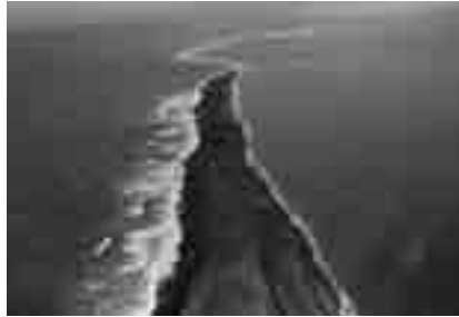
Aerial view of Rose Spit on a clear day, with mainland Canada in the distance.