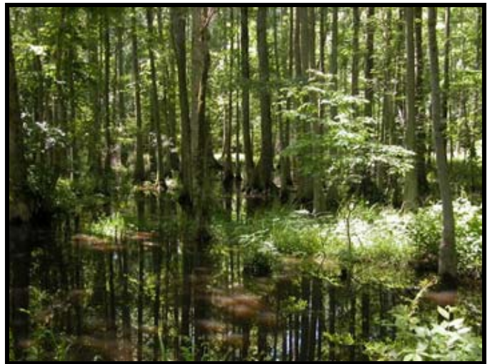
Great Dismal Swamp forest

This IBA is truly an exceptional site for abundance and diversity of breeding and wintering birds. Over 200 species of bird are known to use the area at some point in their annual cycle, while 96 have been reported nesting on or near the refuge. The Great Dismal Swamp is one of the only known places in Virginia to support the Wayne's Warbler, a coastal subspecies of the Black-throated Green Warbler. It also supports the only known population of Swainson's Warblers on the coastal plain. High priority Neotropical migrant species such as the Prothonotary Warbler, Worm-eating Warbler, Prairie Warbler, and Wood Thrush occur on the IBA in large numbers during the breeding season. With the exception of the Cerulean Warbler, this IBA supports all of the species indicated by