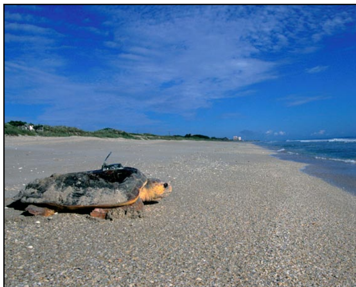
A loggerhead sea turtle approaches the water