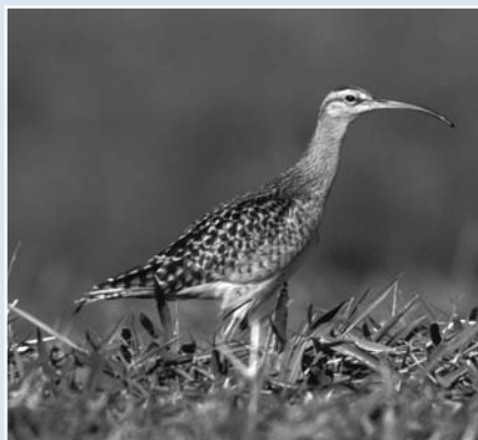
About 60 percent of all Bristle-thighed Curlews breed at the Andreafsky Wilderness, an Important Bird Area east of the Yukon Delta in Alaska.