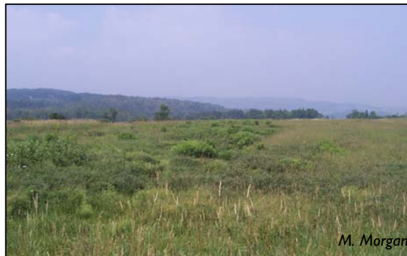
Grassland habitat in NY

Adapted from Lanyon 1995 and NatureServe 2008.