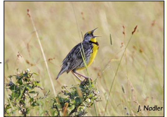
Eastern Meadowlarks use elevated perches for singing.

Breeding Bird Survey data indicate a drastic decline in Eastern Meadowlark populations in New York since 1966. Partners in Flight lists this species as Regional Concern in Bird Conservation Regions 13 and 28. New York Breeding Bird Atlas data show a significant reduction in distribution in the Hudson River Valley, particularly in the south.