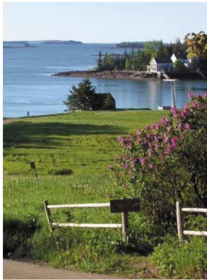
Hog Island Camp photo