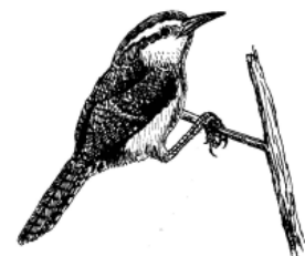
Carolina Wren

To learn more about the upcoming Great Backyard Bird Count, go to the website at http://www.birdsource.org/gbbc/ .