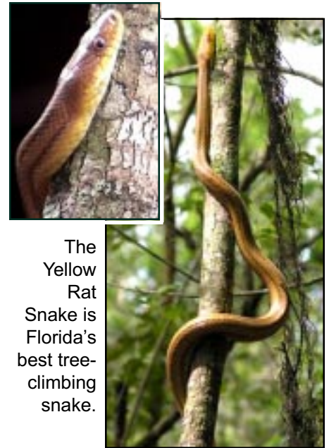
The Yellow Rat Snake is Florida's best tree-climbing snake.

Tip: To explain the idea of concertina movement to a visitor, illustrate the push/pull movement of the musical instrument, the accordion. For you non-musicians, a concertina is a type of accordion.