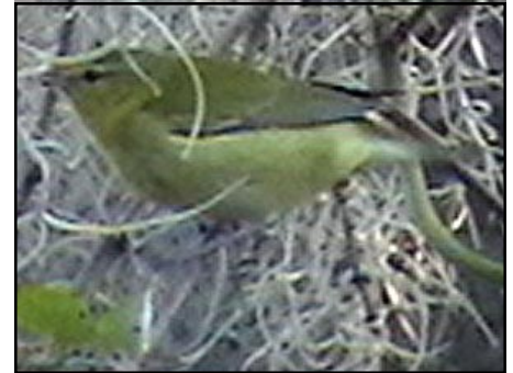
A Philadelphia Vireo stops for some insects before heading further south (October 20).

Below is the list of bird and butterfly species spotted by volunteers during October. For mammal and herp sightings plus frequency of all sightings, go to the Corkscrew web page ( www.corkscrew.audubon.org ) and click on "Wildlife."