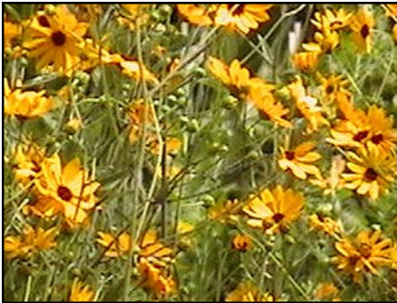
Narrow-leaf Sunflowers bloom near the wildlife crossing (October 3).