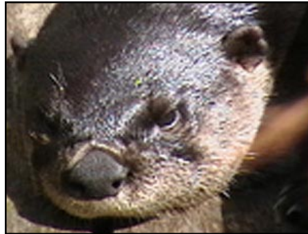
A River Otter rests in front of the pond cypress bench along the exit trail (October 10).