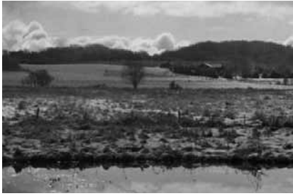
Reflections of winter in Wisconsin's Chippewa County.

luck, both good and bad. Even so, over the years these factors balance out, and with the tremendous number of counts and participants and great geographic range in which CBCs are conducted, the Christmas Bird Count certainly must be the greatest "citizen science" project in existence. I'm proud to be a part of that and congratulate everyone who has ever taken part.