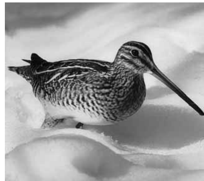
Wilson's Snipe ( Gallinago delicata) in snow, Chippewa County.

The regrettable feature that stands out in my memory is the explosive housing development that has occurred here over the last half century. This blight on the landscape has accelerated at an alarming rate in the past decade. Many of our wild, beautiful, and pristine places are being swallowed up by newly developed real estate. And with that development comes highways, traffic, and increased noise. It is not a trend welcomed by the nature lover.