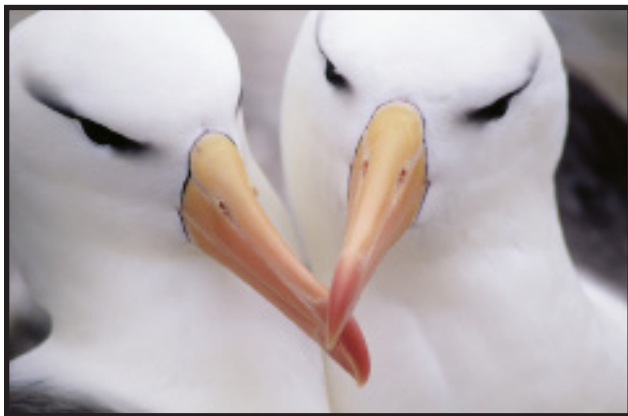
Black-browed Albatross. Albatross typically form pair bonds for life, which can be up to 60 years or more.

Protecting albatrosses and petrels necessitates international cooperation in regulating longline fishing and other activities. The United States is currently a world leader on seabird bycatch mitigation through laws such as the Endangered Species Act, the Migratory Bird Treaty Act, and the Magnuson-Stevens Fishery Management and Conservation Act. By ratifying and formally joining ACAP, the U.S. would increase the Agreement's international influence and resources and would improve its ability to conserve seabirds. The United States would also be able to promote more stringent international regulations to level the playing field between domestic fisheries and international fisheries. The ratification of ACAP has enjoyed bipartisan support, including from former President George W. Bush and President Obama.