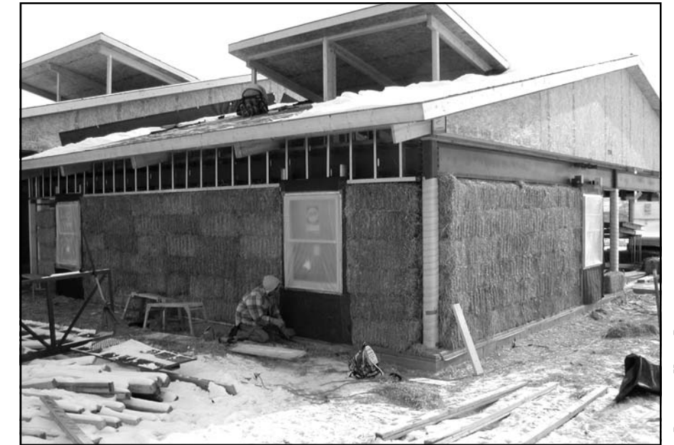
Hay and straw bales placed inside new education building.