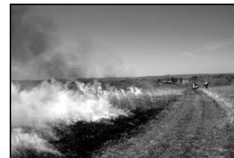
Staff and volunteers oversee a prescribed burn.

On the area with a high density of invasive woody species, we wanted to see if a fall burn would reduce their numbers. Past spring burns have had little impact on these plants.