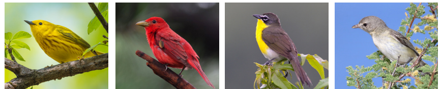
Left to right: Yellow Warbler, Summer Tanager, Yellow-breasted Chat, Bell's Vireo